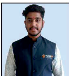
Pratik Chaudhari Vishwaraj Hospital