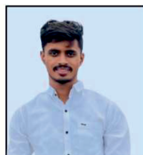
Shelar Omkar Clinispringle